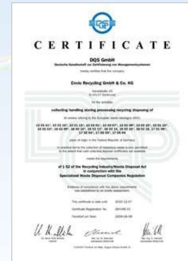
Specialist Disposal Company

The current version of certificates are available for download on our website www.envio-group.com (“about us” → “certification”)